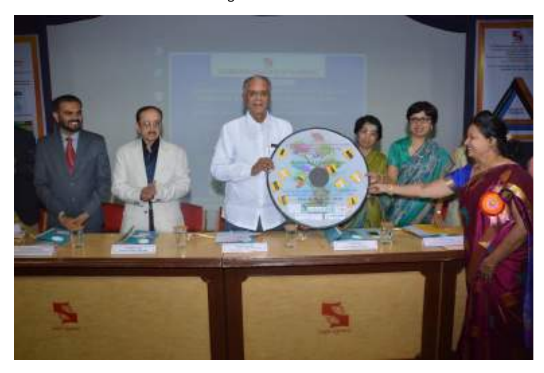
Inaugural of e- souvenir of Conference