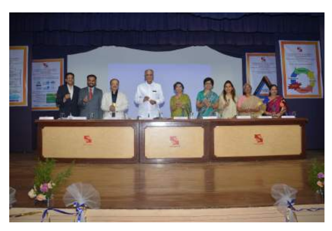
Inaugural of Conference