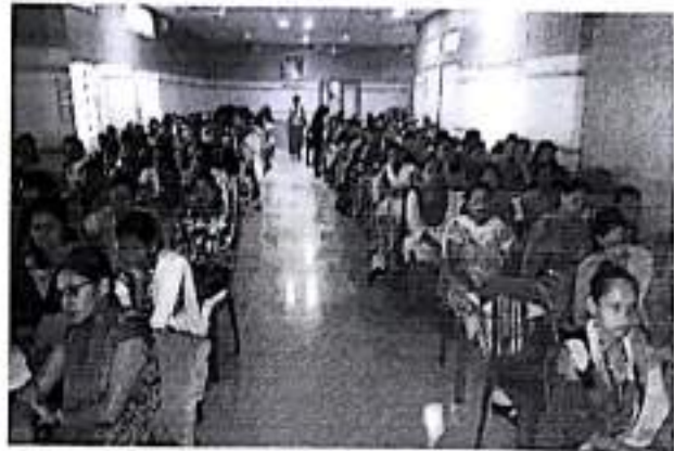
Speakers during felicitation session